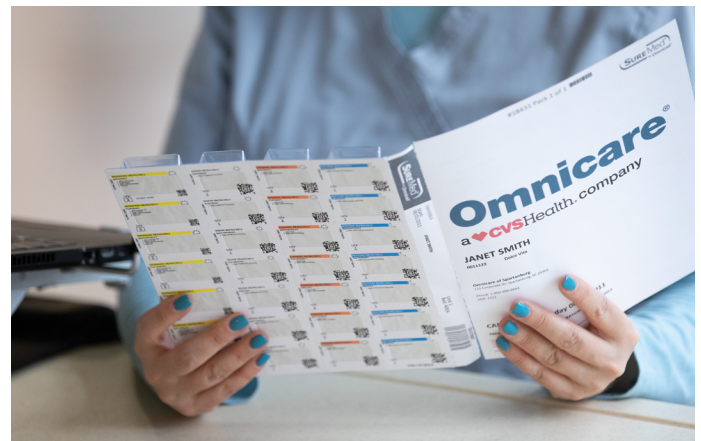
On-site clinical specialists help mitigate risk of medication errors

In facilities where patient turnover is high and patients are more acutely ill than those in a traditional LTC facility, it’s important for the customer to have an on-site pharmacist to monitor labs, daily or weekly