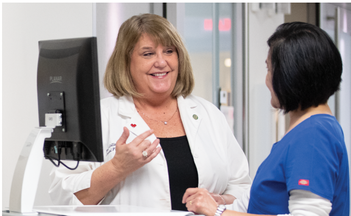
Omnicare clinical experts work directly with the facility staff

the evening. The patient had orders for insulin glargine 22 units at bedtime and insulin lispro 5 units with meals without monitoring. Ryan was on site and able to review the patient's chart and make the recommendations for needed monitoring. His recommendation was for the nurse to order glucose monitoring four times a day.